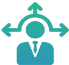
Physical Situation Awareness System

The PRAETORIAN toolset supports the security managers of Critical Infrastructures (CI) in their decision making to anticipate and withstand potential cyber, physical or combined security threats to their own infrastructures and other interrelated CIs that could have a severe impact on their performance and/or the security of the population in their vicinity.