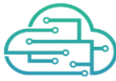
Cyber Situation Awareness System