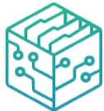
Hybrid Situation Awareness system