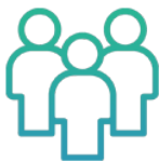
Coordinated Response system